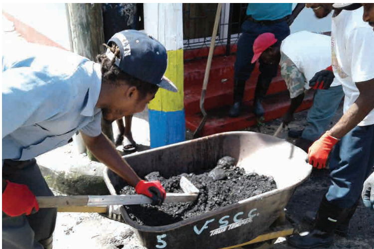
Cleaning of drains before hurricane season

"The docks have been dormant for years . . . the funds are already there so we can re-open the docks. Before it was only for containers, but now we want it to be for vehicles, lumber, and everything you can find. That is where the economic spin off will start . . . you will have more people on the docks, and the business people won't have to pay $1000 to bring their containers from the north."