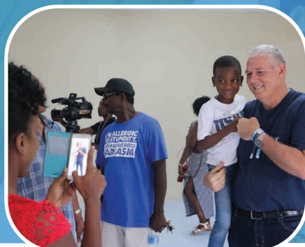
All smiles for a photo with the Hon. Prime Minister in Sarrot