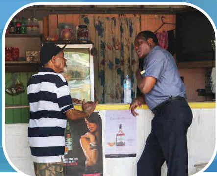
Monchy vendor gets a chance to speak with Minister Montoute about the issues