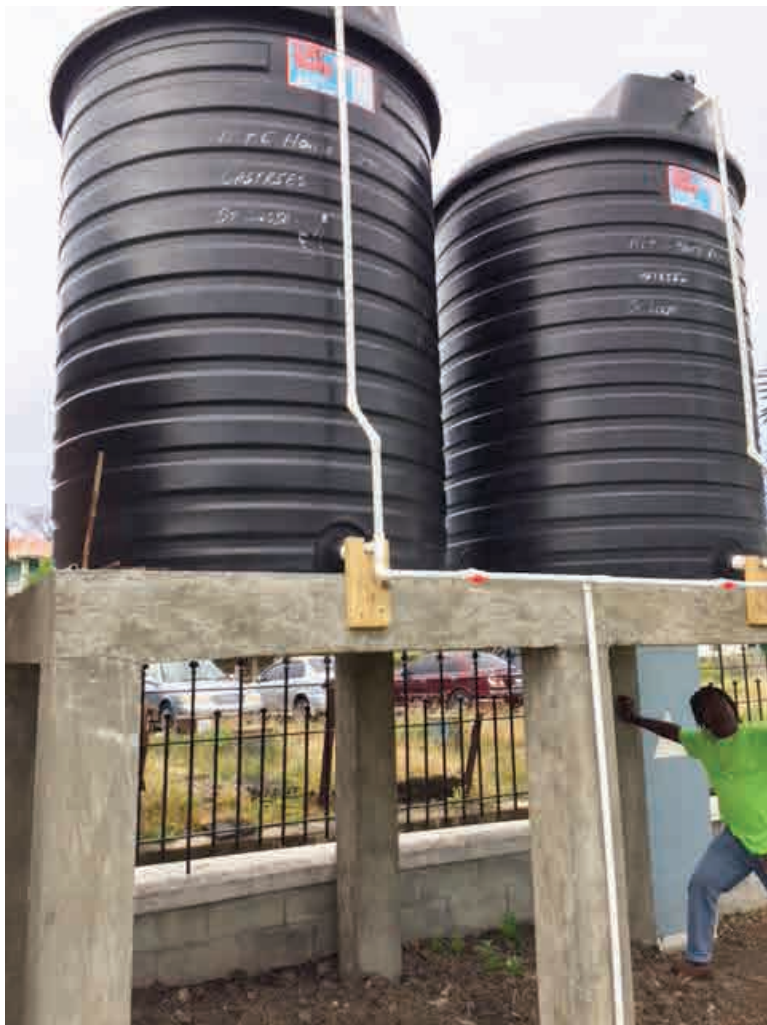
Water storage for the square