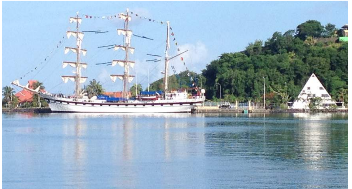
'Simon Bolivar' berthed majestically alongside The Pyramid at the Pointe Seraphine cruise ship complex during its four-day stay.