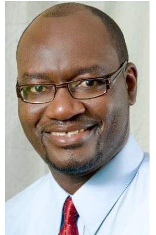
Hon. Moses Jn Baptiste

All those programmes allow our people to manage the risks involved as they navigate their roles pro-