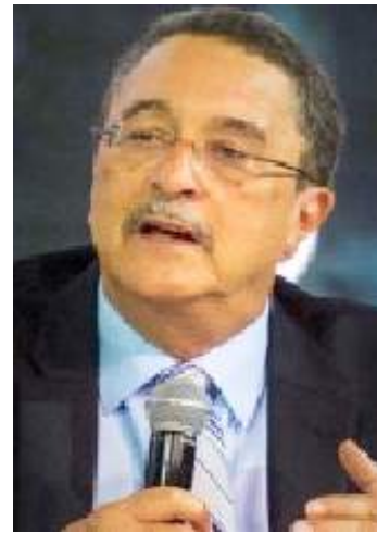
The Prime Minister told the Forum Saint Lucia will begin accepting applications in the New Year.

The Prime Minister informed the gathering of citizenship lawyers, wealth managers, marketing agents, investors and VIPs that Saint Lucia, by ac-