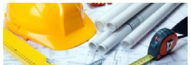
The program will help practicing contractors better understand the basic requirements for

The program was designed to help industry professionals (practicing contractors) understand the basic requirements