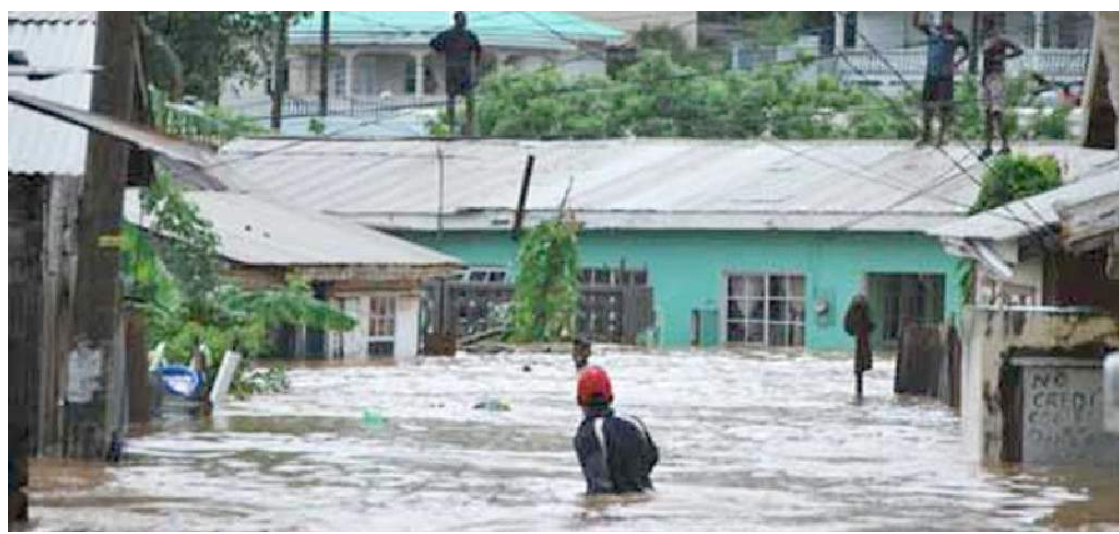
The media, artistes and young people are called to amplify the peculiar vulnerabilities, risks and devastating impacts of climate change on Small Island Developing States.

Clarion call is being made for media workers, young people and artistes to join a regional movement to amplify the peculiar vulnerabilities, risks and devastating impacts of climate change on Small Island Developing States (SIDS) like Saint Lucia.