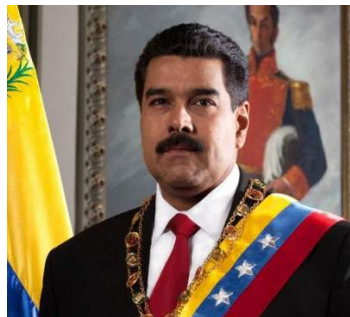
Bolivarian Venezuela's President Nicolas Maduro Moros

The Entourage would then proceed to Government House for a Courtesy Call on Governor-General Dame Pearlette Louisy. The Official Party then moves on to the Official Residence of the Prime Minister, where President Maduro and Dr. Anthony will hold bilateral discussions on matters of mutual concern