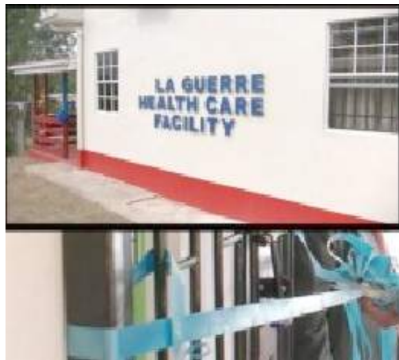
The expanded facility now includes a client waiting room, reception records area, a doctor's office and examination room, a treatment clinic, pharmacy and dispensing booth, and a nursing station. Health Minister Alvina Reynolds (above) cut the ribbon for the expanded centre, one of several being constructed by government through the SSDF with CDB-BNTF funding.

Minister for Health, and Parliamentary Representative for Babonneau, Alvina Reynolds