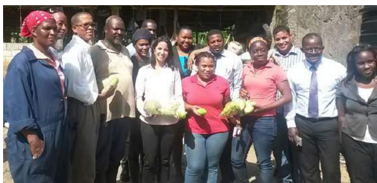
The Venezuelan and ALB Ambassadors with the NICE officials and beneficiaries employed through various social programs, thanks to a US $10 million ALBA-TCP grant that will keep the program going for three years.

The Team then travelled to the farming community of Dennerly,