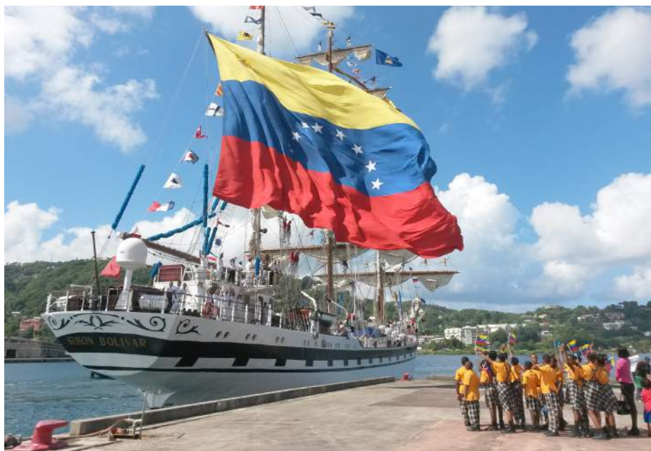
Students from Carmen Renee Memorial School waved the crew of 'Simon Bolivar' on arrival and departure at Pointe Seraphine.