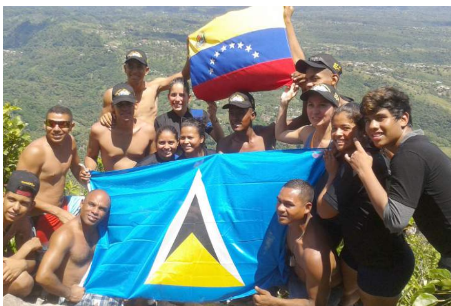
The Venezuelan sailors, soldiers, officers and cadets of the 'Simon Bolivar' took time off while here to join local cadets and staff of the Venezuelan Embassy to climb the Gros Piton and fly the two friendly nations' flags.