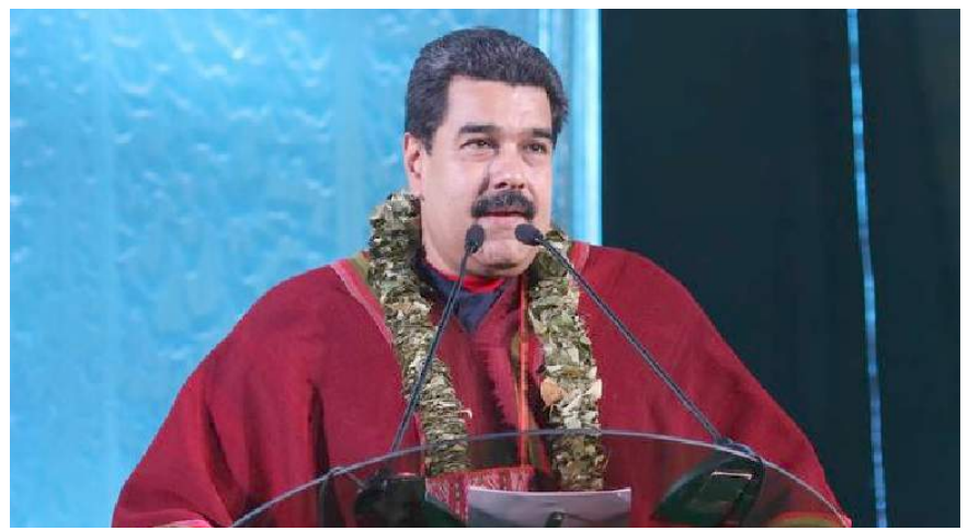
Venezuela's president Nicolás Maduro urged to the Heads of States to transform the World Climate Summit in Paris, France, in a space for the expression of the peoples.

"We cannot believe in oligarchies and in the