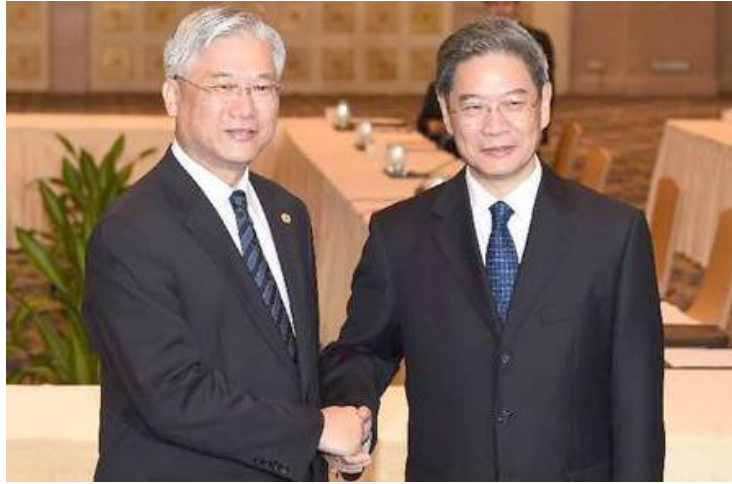
The director of the State Council Taiwan Affairs Office, Zhang Zhijun (R) shakes hands with Taiwan's cross-strait affairs chief Andrew Hsia in Guangzhou, capital of south China's Guangdong Province on October 14.

Hsia said the achievements over the last seven years in cross-strait development must be cherished and protected, noting that the "1992 Consensus" was the foundation for normal exchanges between Taiwan and the mainland.