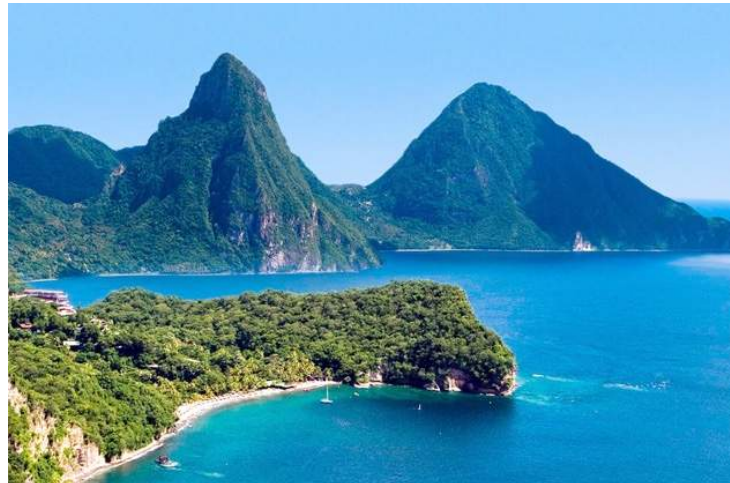
Scenic photos like this from anywhere on the island will qualify for consideration – and bring home the prize bacon!

In the run up to a major launch of its new and highly interactive destination website scheduled for the end of 2015, the island's lead promotions and marketing agency – The Saint Lucia Tourist Board – has initiated an online photo competition.