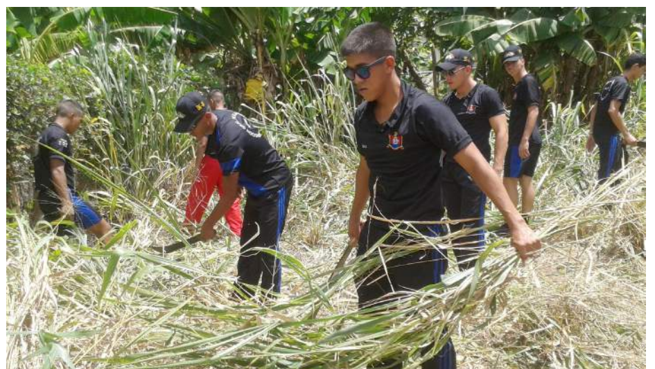
The captain and crew of the visiting Bolivarian 'Ambassador without Borders' performed voluntary work while here, including cleaning-up an area of overgrown grass.