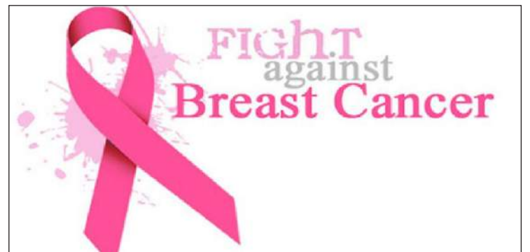
The Ministry of Health collaborates with Digicel in the fight against breast cancer for the month of October.

Digicel has also collaborated on other cancer initiatives such as the recently-held "Walk for a Cure," CFL's Yoplait Walk (Nov. 1), and the Wave's "Men in Heels."