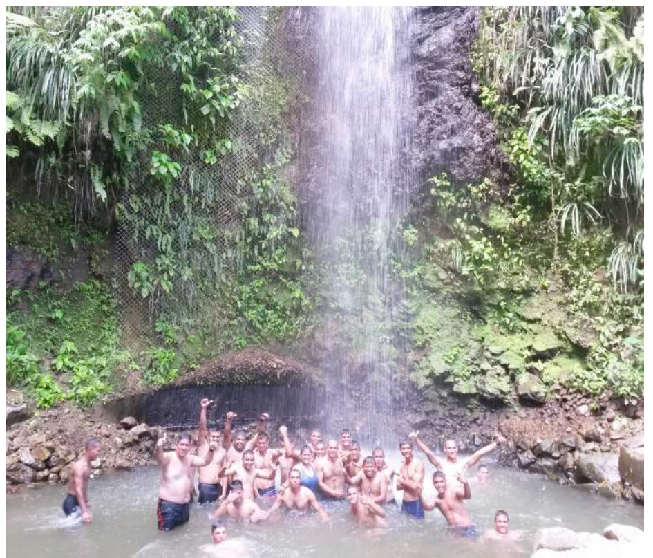
The visiting Venezuelans joined their local counterparts and friends for a refreshing bath at Torelle Waterfall at the Botanical Gardens in Soufriere.