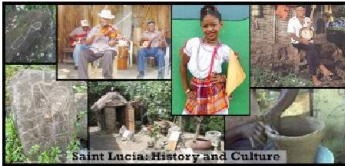
The program, hosted by the Folk Research Centre, enables students to understand and appreciate their cultural heritage

"They apply to come to the FRC and we instruct them on the culture of the country as it relates to dance, music, the history of Saint Lucia, various cultural icons, their contributions