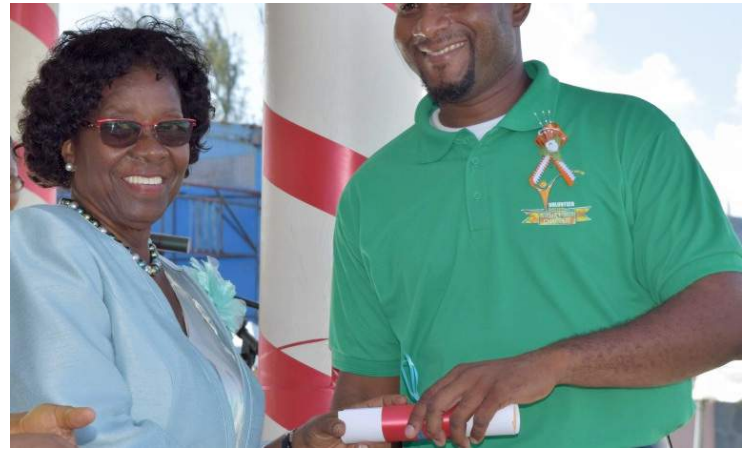
The Governor General is a patron for the local volunteer movement and has participated in several induction ceremonies.

Students will participate in a variety of fun numeracy activities including a Mental Math Competition, Scavenger Hunt, and Math Jingle Contest.