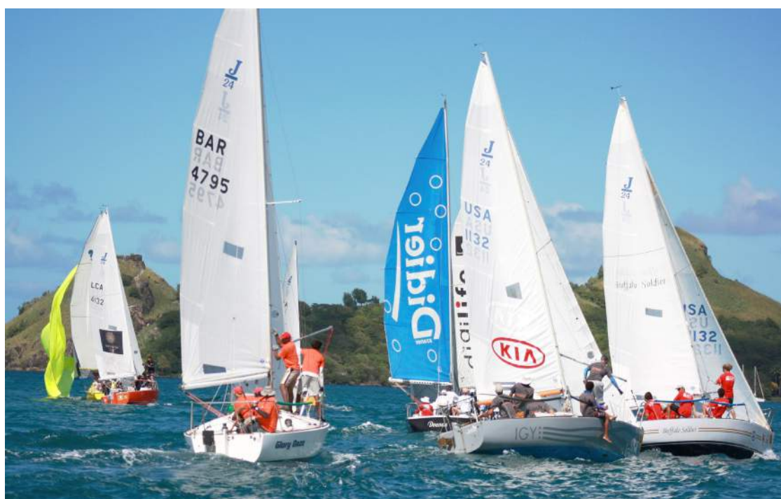
With Mango Bowl 2015 kicking off the regional regatta season, Saint Lucia has good reason to be proud of its local sailing community's continuing achievements and SLYC looks forward to celebrating with fair winds and fast racing on the last weekend of November.

Mango Bowl 2015 also promises to raise the social bar with a Saturday night BBQ Beach Party on the sand in front of the St. Lucia Yacht Club clubhouse, barbecue and cocktails by the team from Delirius, steel pan music and a late night DJ to provide the oldie-goldie atmosphere.