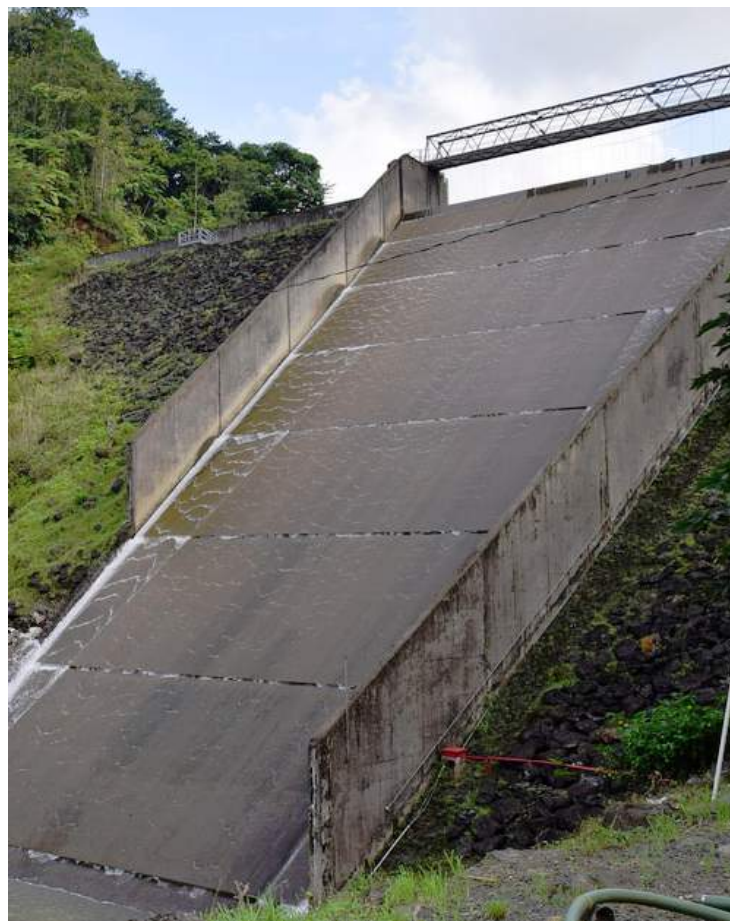
Dredging and de-silting of the Roseau Dam will soon get underway.

That project involves the construction of a new intake, the rehabilitation of an existing intake, the construction of a new, fully-equipped conventional