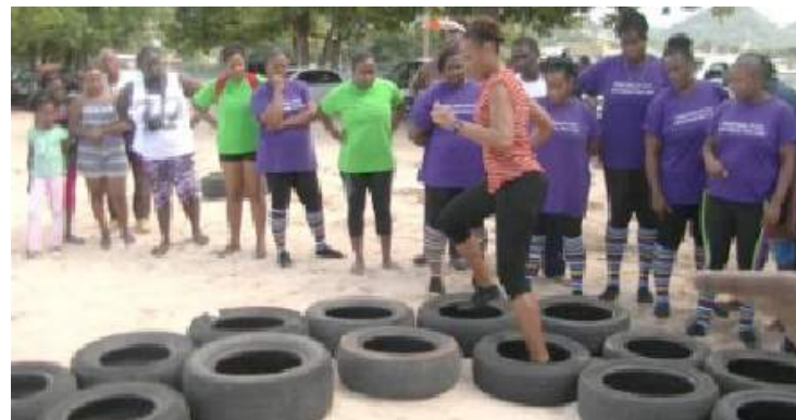
The final challenge, an obstacle course, was held on Vigie Beach last Sunday and the final weigh-in was held yesterday.

Pedi Gwés Sent Lisi - Bon Santé Pou Lavi, is a weight loss competition organized by the Ministry of Health, Wellness, Human Services and Gender Relations. It is geared at assisting competitors to manage their weight by making lifestyle changes through proper eating habits and exercise.