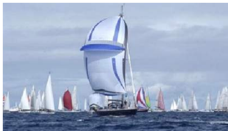
The ARC 30 fleet after leaving Las Palmas last Sunday

There is a full schedule of events in Rodney Bay for all ARC crews and their friends and families, culminating in the ARC prize giving on December 19.