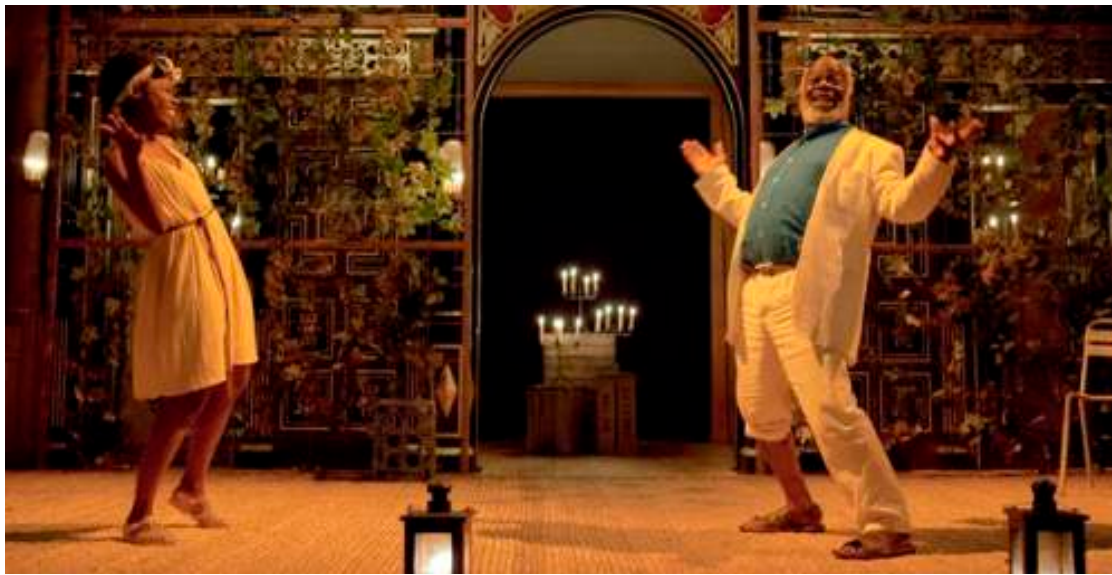
POETRY IN MOTION! The top class Omeros cast turned Walcott's words into actions that breathed life onstage.

Thespian (from which the word Thespian is derived) is credited as being the first person to introduce dialogue to the stage in 6th century