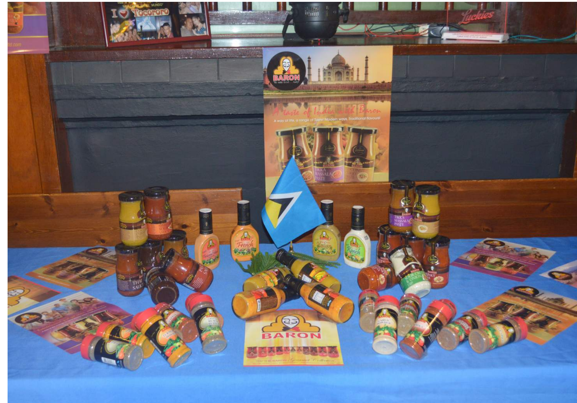
Baron Foods product display also drew commendations from all who saw it, leading to inquiries about other local products as well.