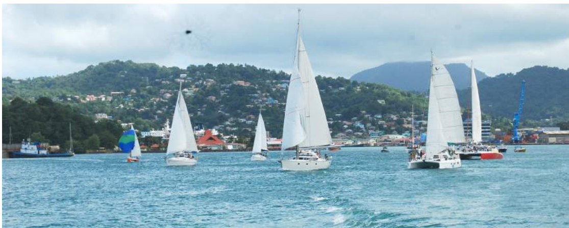
Local yachts and sailing boats floated their way from the Castries Harbor to Rodney Bay in the 2015 Flotilla that set sail at the same standard time as the international fleet left Las Palmas.

The 30th edition of the Atlantic Rally for Cruisers started in spectacular style, as the yachts taking part in the 2015 Atlantic Rally for Cruisers made their way out of Muelle Deportivo in Las Palmas de Gran Canaria Sunday morning, en route to Saint Lucia.