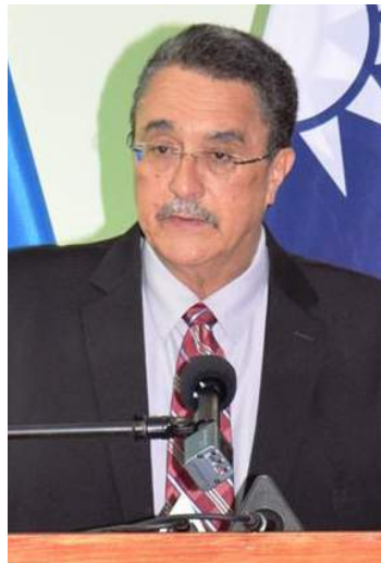
Prime Minister Dr Kenny D. Anthony delivered his comprehensive address in the presence of senior Saint Lucian and Taiwan officials at the usual venue (Office of the Prime Minister), during which he again outlined more reasons to make the Taiwanese proud of the level of transparency and accountability involving receipt and use of funds donated to Saint Lucia, to create social transformation in communities around the island.

SPECIAL UNDERTAKINGS This morning is an important milestone in the implementation of three special undertakings of this Govern-