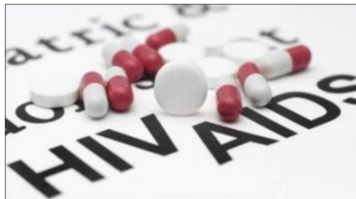
PANCAP hopes to end the AIDS epidemic by reducing viral loads to levels low enough to prevent transmission.

The UN Special Envoy for HIV in the Caribbean has been requested to lead a series of engagements that would seek to adopt a phased implementation of the actionable