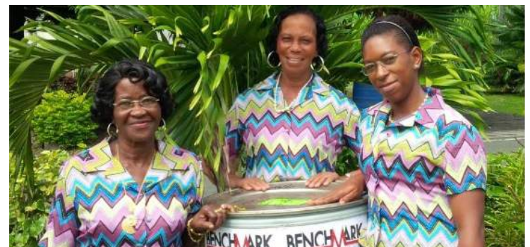
Members of the Babonneau Mothers and Fathers group thanked Benchmark for their continuing assistance to the community.