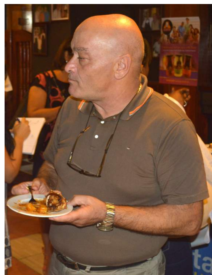
TASTY TASTINGS! All who tasted Saint Lucia's tasty tastings had much to say about the fine quality of the island's products.