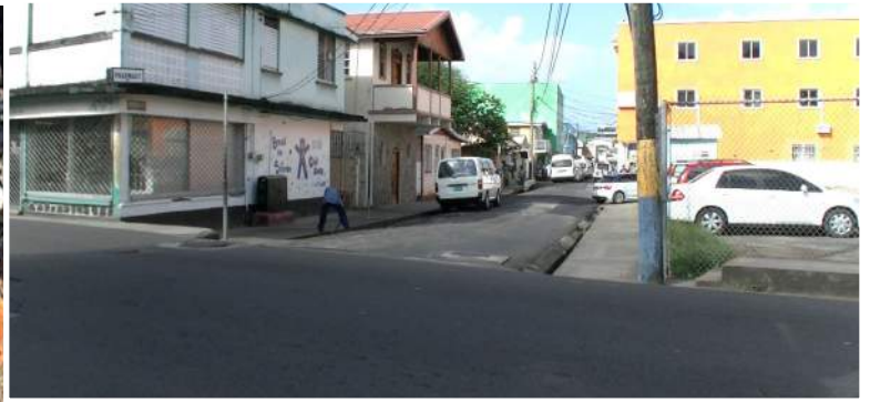
The national potholing exercise will fix broken roads in several parts of the island. Photo (at right) shows Victoria Street in Castries after it was potholed recently.

munities in the south will also see better roads in the near future.