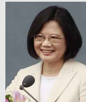
President. Tsai Ing-wen

Premier Lin Chuen, head of the government's Executive Yuan, also conveys his best wishes to Prime Minister Chastanet, and he expects Taiwan's comprehensive