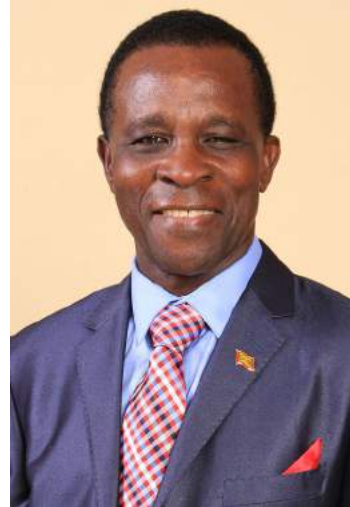
Dr. Keith Mitchell urged the incoming prime minister to chart the course toward a new era of governance and growth.

Prime Minister Mitchell assured the new leader that Saint Lucia has the continued commitment of the government and people of Grenada to further