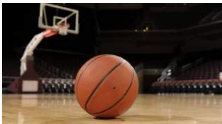
The camp connects athletes from Caribbean territories to coaches and scouts from schools in North America.

the Most Valuable Player for Saint Lucia in the Windward Islands School Games in 2015.