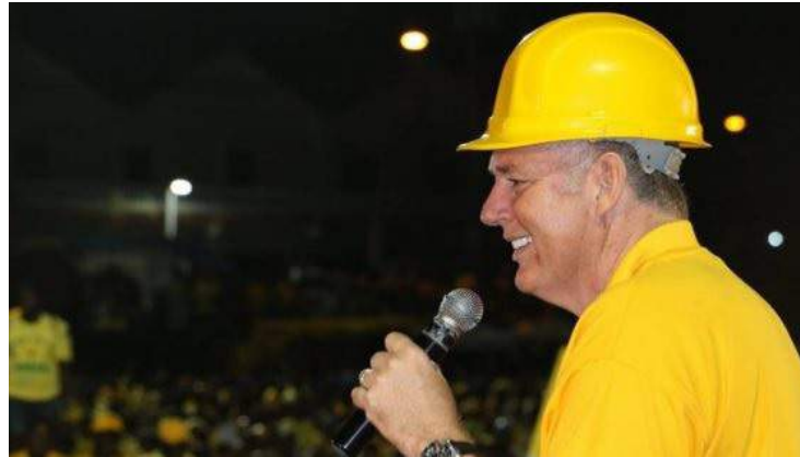
New Prime Minister Allen Chastanet

Chastanet recalled meeting some people opposition supporters who asked his opinion as to why the party lost the election. He said he told them that the people of this country were tired