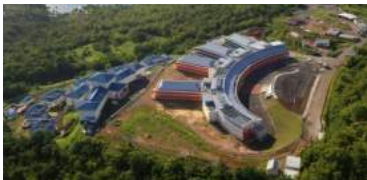
A staff and visitor cafeteria, kitchen, laundry and car park are being built.

Construction upgrades at the Owen King EU Hospital are underway.