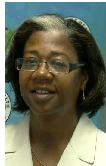
Minister for health and Wellness, Senator Mary Isaac

The Minister met with her Deputy and Permanent Secretary for a brief overview of the