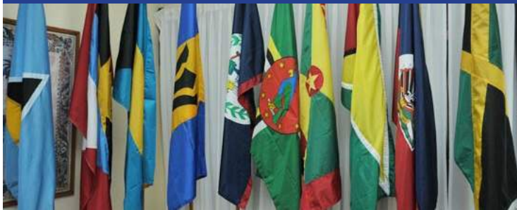
The OECS Commission warmly welcomed the newly-elected Government of Saint Lucia into the OECS family.

The OECS Commission earlier this week extended heartiest congratulations to the newly-elected Government of Saint Lucia and Prime Minister Allen Chastanet, following the electoral victory of the United Workers Party at the June 6 general election. In a statement, the Commission said