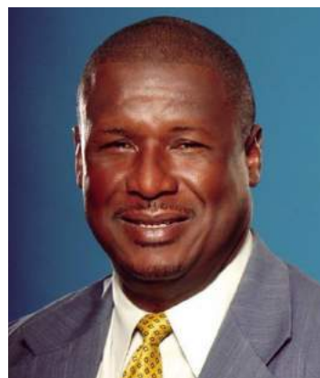
Infrastructure Minister Hon. Stephenson King

Mr King also said there was need to assess infrastructure and conduct an audit to determine what is required to bring the in-