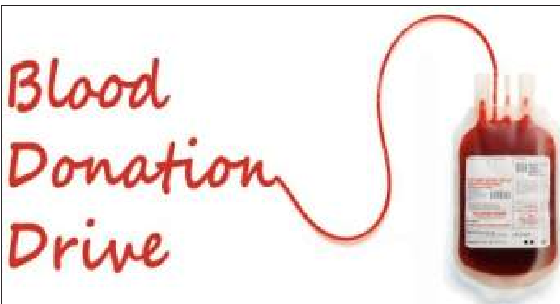
Blood Donor Day was established to raise awareness of the need for safe blood and blood products.

In observance of World Blood Donor Day last week, the Saint Lucia Blood Bank has heightened the appeal for donations to help replenish its constantly depleting blood supply.