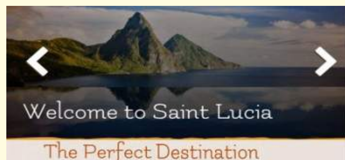
Saint Lucia experiences a surge in Midwestern visitors resulting from non-stop flight service from Chicago.

On the heels of United Airlines' December 2015 launch of non-stop service from Chicago O'Hare International Airport (ORD) to Saint Lucia's Hewanorra International Airport (UVF), visitor arrivals from the United States Midwest region have increased by a record-breaking 15 percent between January and April of 2016. Overall travel from the United States experienced a 4.9 percent increase January through April, maintaining its position as Saint Lucia's key source market, with more than 56,000 visitors. The month of April led the first four months of the year with a nearly nine percent (8.6%) increase in American tourist arrivals compared to 2015. "It is exciting to see the direct correlation between United Airline's new service from Chicago and the increase of American visitors from the Midwest region," said Director of Tourism Louis Lewis. "Combined with the ongoing hotel development projects and new direct flights, Saint Lucia is primed to welcome new and repeat visitors."