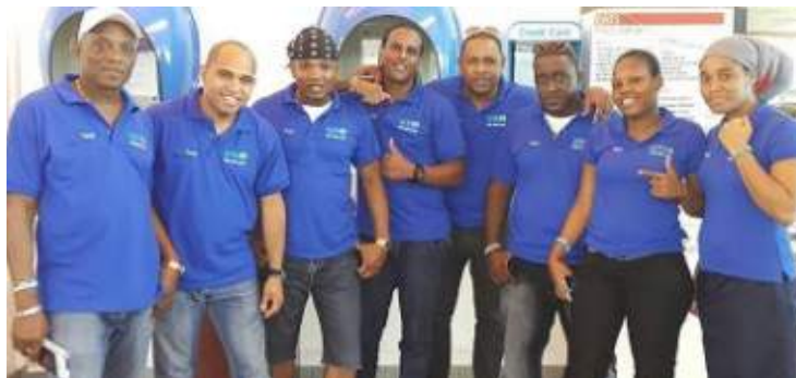
Team Saint Lucia readies for Taste of the Caribbean competition in Miami

The nine-member Team Saint Lucia to the Taste of the Caribbean culinary competition is currently in Miami to take on more than 10 other countries in the Caribbean Hotel and Tourism Association's annual competition for Caribbean chefs. Saint Lucia's participation in the regional Taste of the Caribbean competition is organized by the Saint Lucia Hotel and Tourism Association (SLHTA). As part of its preparations, the SLHTA hosted a series of practice dinners where patrons paid to taste the culinary delights of Team Saint Lucia as part of the training to fine tune their respective specialties ahead of their food battles. The revenue from the practice dinners together with sponsorship from corporate entities helped cover the costs associated with the team's participation in the competition. Saint Lucia Electricity Services Limited (LUCELEC) has consistently supported Saint Lucia's participation in the culinary competition.