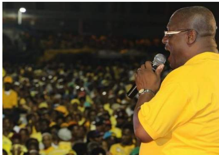
Infrastructure Minister Stephenson King addressing the UWP victory rally last week.

the UWP says to the party to go out and work with and in the interest of people of Saint Lucia.