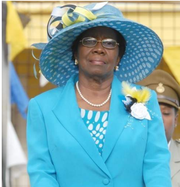
Governor General of Saint Lucia, Her Excellency Dame Pearlette Louisy.

Blindness Awareness Month was held under the theme: "Empowering today's youth, tomorrow's leaders, by promoting an inclusive society"