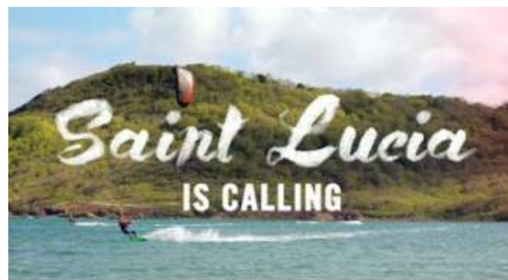
The majority of visitors from Martinique and the Caribbean come to Saint Lucia for summer.

The Saint Lucia Tourist Board (SLTB) has launched a summer promotion in Martinique titled "Vacances Magiques Saint Lucia." Saint Lucia records the majority of visitors from Martinique and the other Caribbean islands during the summer months; as such, the promotion will highlight the variety of things that Saint Lucia has to offer. Research in Martinique suggests that beyond the Pitons, the Saint Lucia Jazz and Arts Festival, and Gros Islet Friday night, the majority of visitors from Martinique are not aware of the variety of hotels, restaurants and activities that can be found in Saint Lucia. As a result, the promotion will highlight exciting family, group and couples activities. The SLTB will also promote excellent pricing and value for money packages through partnerships with local tour operators. The promotional campaign starts June 1, and will include digital advertising, direct mail to relevant databases in Martinique, television, radio, print and cinema advertising. The launch will be held on June 3 and 4 at the Galleria Travel Show in Martinique.