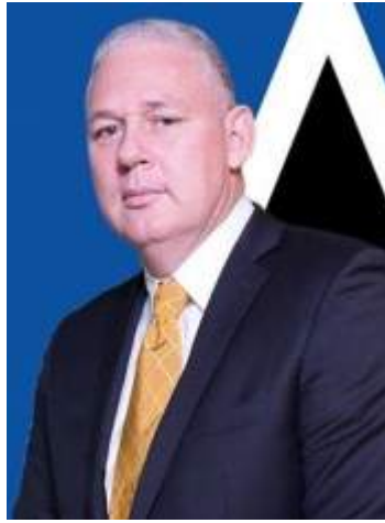
Prime Minister Allen Chastanet

"The cost of flying between Martinique and Saint Lucia is prohibitive," Chastanet observed, adding that there is cur-