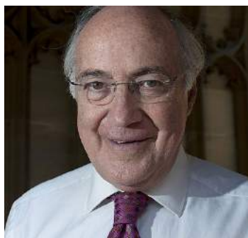
Former leader of the UK Conservative Party Lord Howard

Lord Howard told the Saint Lucia media that he "congratulates the Island's Prime Minister upon his election result and on taking office on Tuesday. It was a decisive result and part of a democratic process that all of us in the free world cherish. The BCCCSL looks forward to continuing its work in Saint Lucia and to building stronger economic and commercial ties between our nations, throughout the term of this new Government.