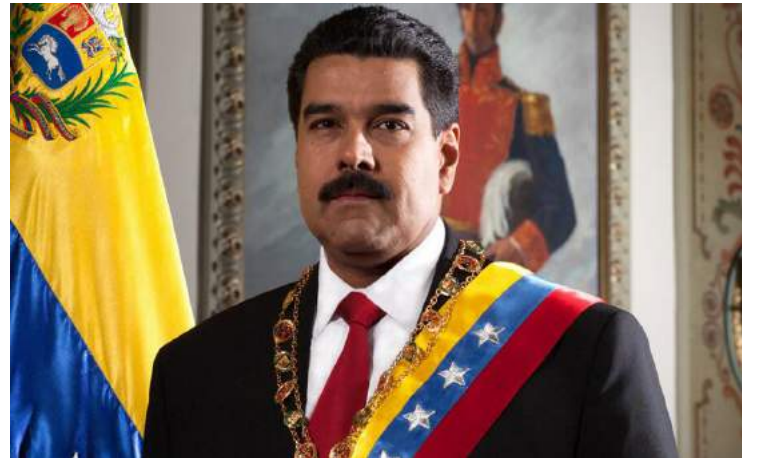
President Nicolas Madura Moros

The Bolivarian Government reaffirms to the new Government of Saint Lucia its unquestionable willingness to continue working together in order to deepen the already excellent relations of friendship and brotherhood, relations based on the principles of mutual respect and solidarity that exists between our Nations.