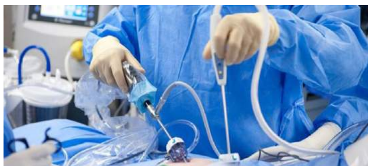
The hospital hosted a laparoscopy workshop aimed at developing surgical techniques.

The conference will feature a variety of presentations from a cadre of distinguished local, regional and international surgeons, ranging from the management of gastro-intestinal bleeds and updates on the latest technology in cancer diagnosis and management, to advances in trauma and burn management.