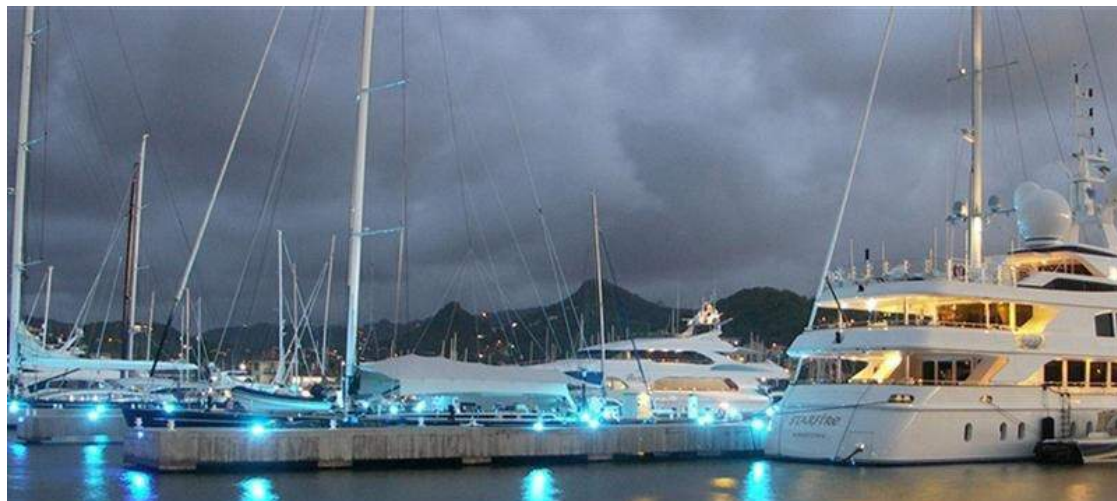
Agencies collaborate with a view to making the sector more competitive within the Caribbean region.

The Ministry of Tourism, Heritage, and Creative Industrie, and the Saint Lucia Tourist Board (SLTB) have partnered to enhance the island's yachting sector. The two agencies convened a meeting on June 1 with officials from the Saint Lucia Air and Sea Ports Authority (SLASPA), the Soufriere Marine Management Association (SMMA) and the customs and immigration departments to discuss issues specific to yachting facilitation. Many issues facing the yachting industry were highlighted and discussed with a view to making the sector more competitive within the Caribbean region. As a first step to address issues relating to the sector and in particular, product enhancement, yachting facilitation, and data collection, the parties agreed to reactivate the yachting committee to serve as the mechanism to pull all related agencies together with the objective of growing the yachting sector. The first meeting of the yachting committee is slated for the first week of July.