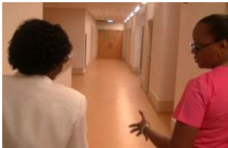
Technical teams have been busy ensuring that equipment is correctly placed within the respective departments.