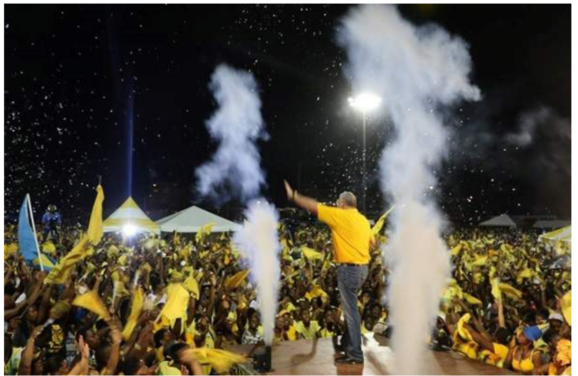
Celebrations were bright and alight in Micoud last Sunday.

When a country votes for healthcare for every man, woman and child, for employment, for empowerment, for education and for a better economy, it signals that a political sea change has occurred. We look forward to making a decisive difference in the lives of all Saint Lucians.