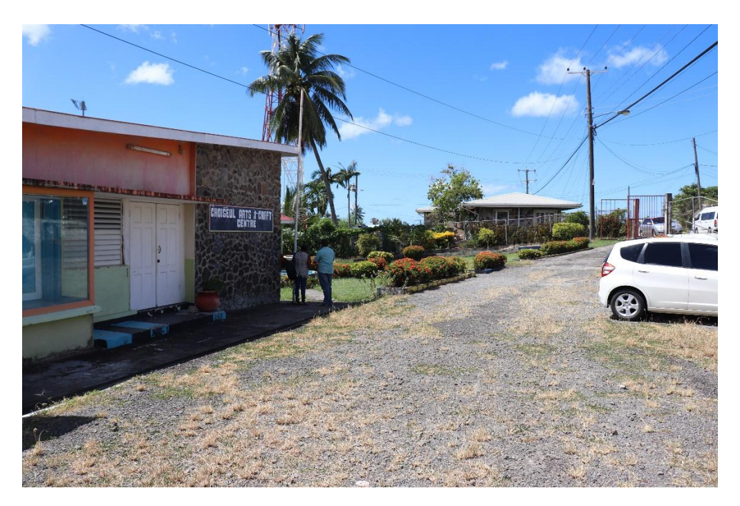
Fig 4 The parking area with the main entrance of the Choiseul Arts and Craft Centre, the La Fargue Wellness Centre is in the distance

There are seven (7) homes positioned linearly across the main road in close proximity to the Craft Centre, and at least three (3) small businesses operating from the nearby residences. Four (4) of the homes include an elderly member who is at home throughout the day, thus the creation of noise and dust emissions will be the major concern for residents, who will be informed of the works generally, and of any activities that may cause increased noise or dust nuisance.