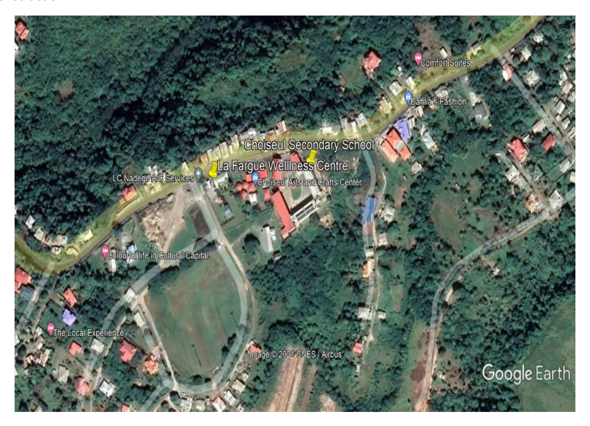
Fig 2: Map of La Fargue in Choiseul showing location of Choiseul Arts and Craft Centre

The Centre has three (3) employees, two administrative and a caretaker for the grounds. Due to the poor condition of the main building where the administrative and retail business would normally happen, the employees have been operating from another section of the building for over a year. In addition to the main building, there are five (5) other enclosed units and two (2) gazebos. The enclosed units are available to continue the operations of the Centre during construction. There is alternative access to the building site, to the back of the buildings without having to walk through the main building, or using the main gates, ensuring that staff, customers and suppliers of craft can transact business safely during construction.