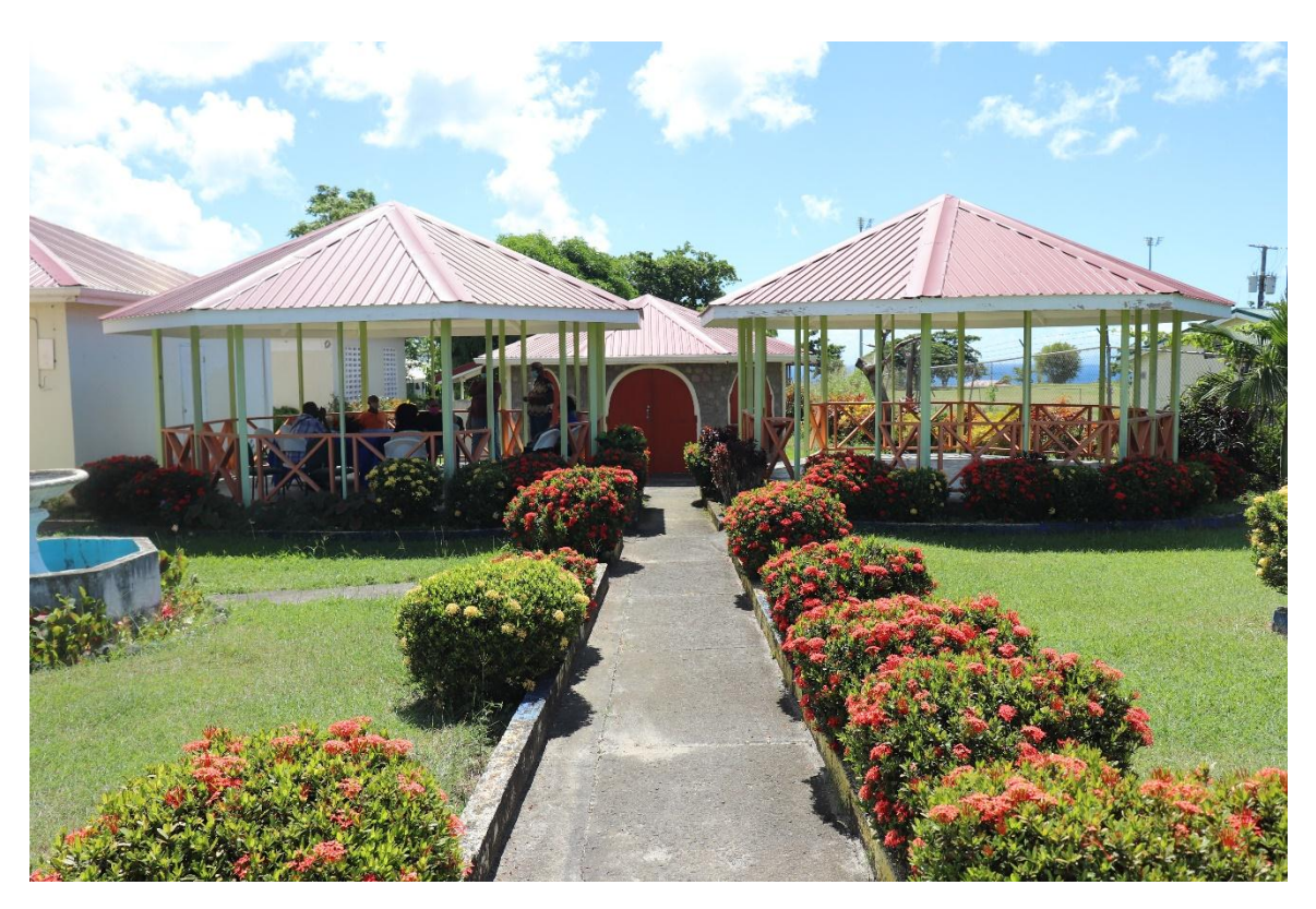
Fig 3 A section of the Centre's Compound with the two gazebos and a restaurant building in the background

The main adjoining structure is the Choiseul Secondary School, a high school with over 600 students and over 40 teachers, roughly 27 metres away from the site. The school recently reverted to face-face instructions after operating through distributed/online learning for many months, and instruction should not be adversely impacted by the construction. It is very likely that the work will coincide with the functioning of the school at certain points as the estimated duration of the works is 4 months. However, if the major work can be scheduled for the July to August period, when the students are on summer vacation, that would be at least two months where the school is mainly vacant. Additionally, there is a speed bump almost directly at the school entrance and one at the entrance to the Wellness Centre, this will reduce the likelihood of speeding, but the contractor will also be instructed to utilize crossing guards at the two points of entry during periods with heavy pedestrian traffic.