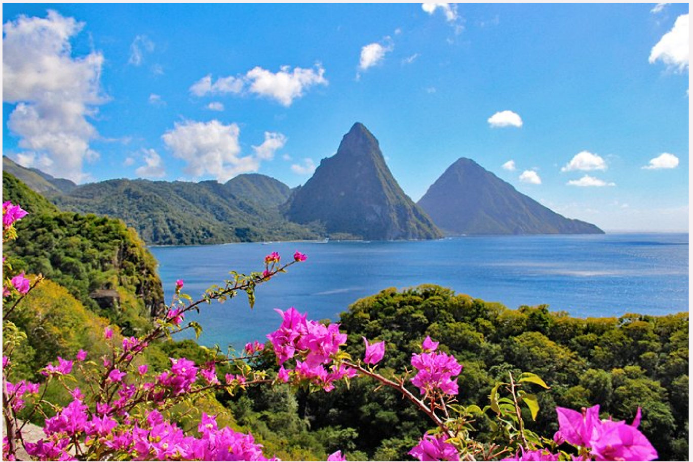
View of the Pitons from Jade Mountain Resort

This newsletter is a product of the Department of Sustainable Development Ministry of Education, Sustainable Development, Science, Technology and Vocational Training Georgiana Court John Compton Highway Saint Lucia Telephone Number: +1 758-468-5863 Email Address: sdestlucia@gmail.com